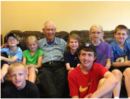
With 7 of my GREAT Grandkids on my Oregon trip