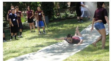
Fun on the water slide