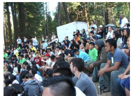
An Evening service