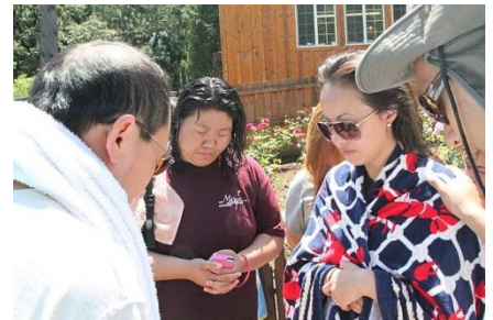
Post baptism prayer