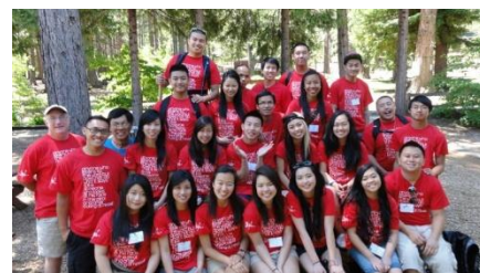
Great Counselor Team

subject of Transparency. 17 youth came forward, many weeping, to pledge to God that they would take off their masks and come before God just as they are – REAL.