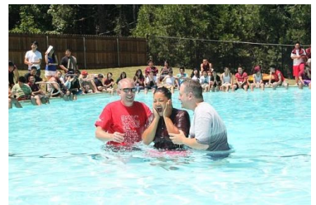
Baptism by main speakers