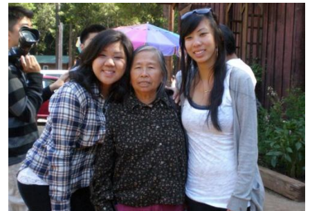
We love our faithful prayer-warrior - in center