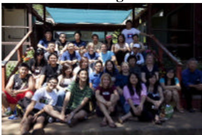
Counselors behaving nicely