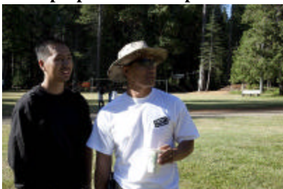
Camp Directors – New & old