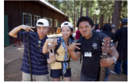
Beware the dreaded desperadoes