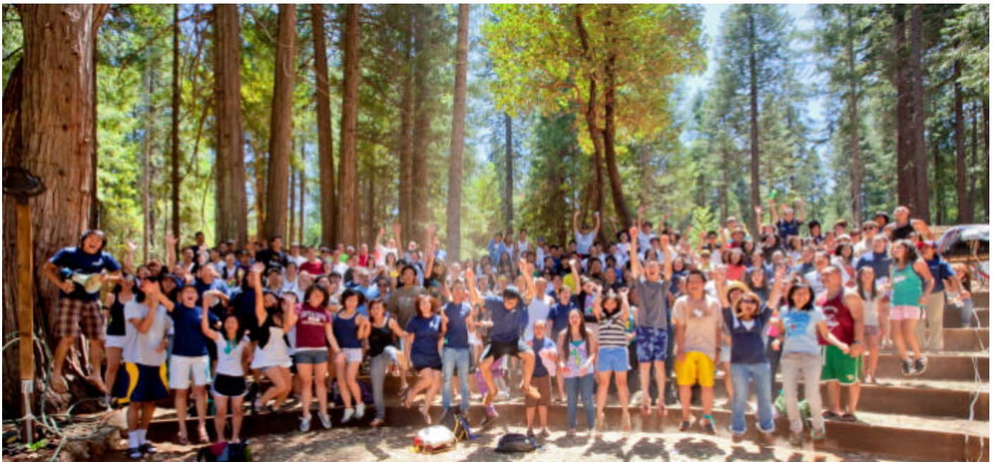
Jumping at the opportunity to search and rescue lost souls for Jesus