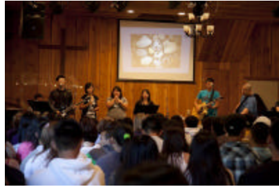
Seattle Worship Team