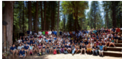
Most of the Campers