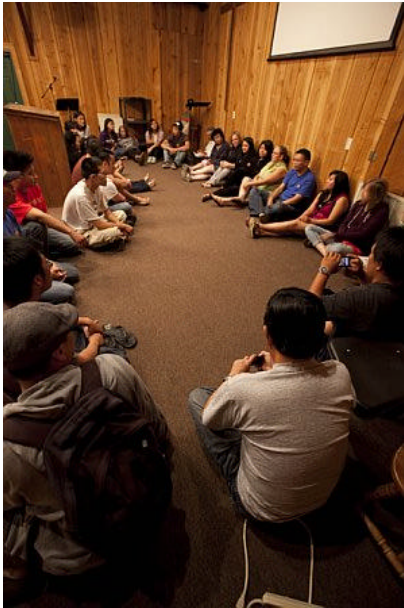
Counselors waiting on the Lord