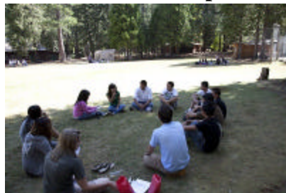
Small Groups all over