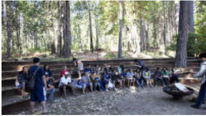
Counselors worship before campers arrival