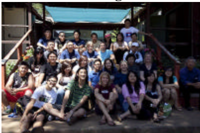
Counselors behaving nicely