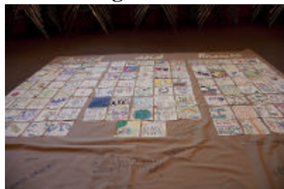
Jr. High Campers' concepts of Search and Rescue