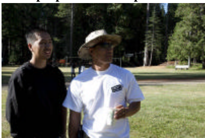
Camp Directors – New & old