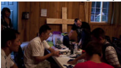
Staff prepares for campers arrival