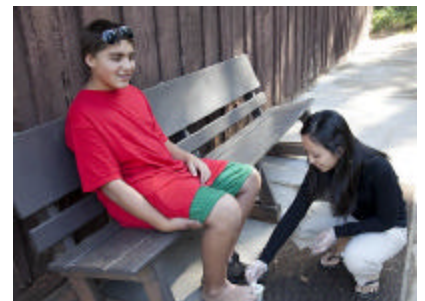
Thank you, Nurse. It's better already